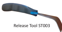
Release Tool ST003